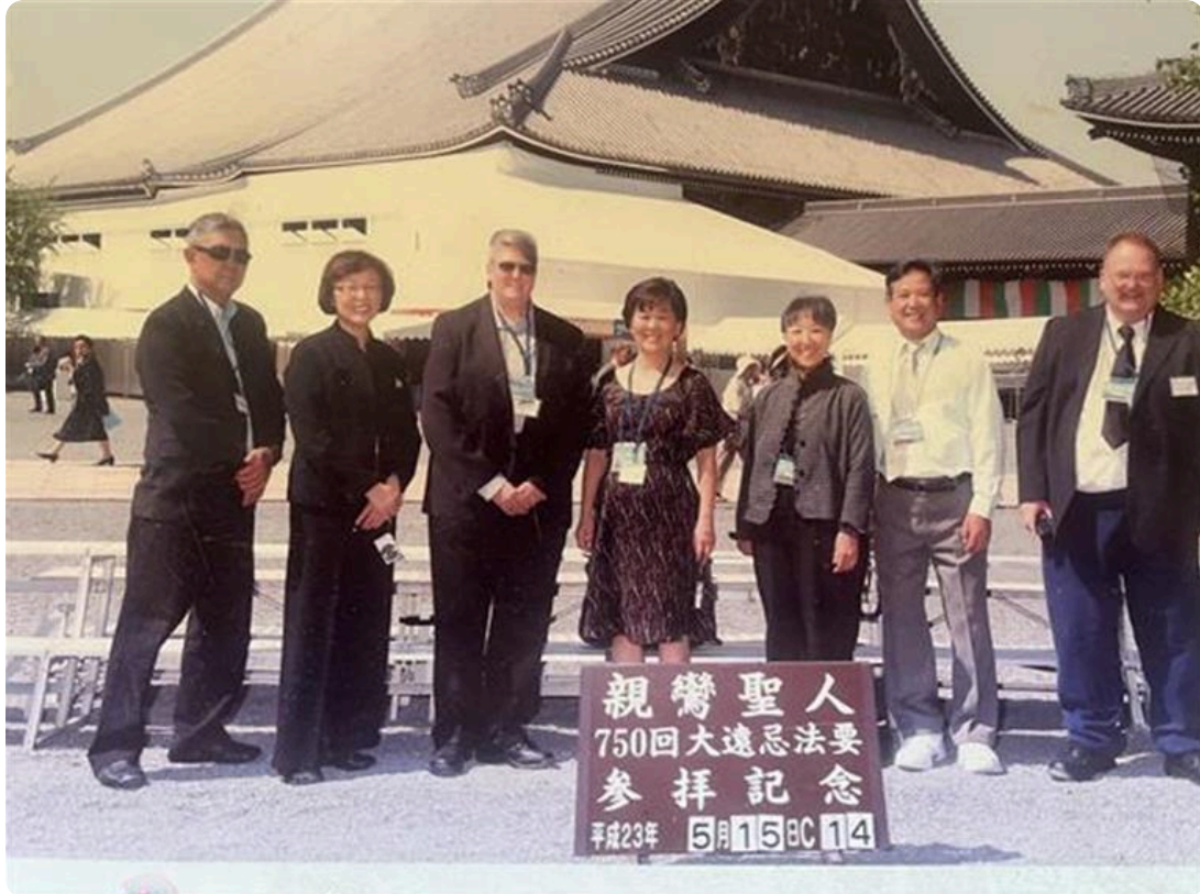
When we traveled to Japan in 2011