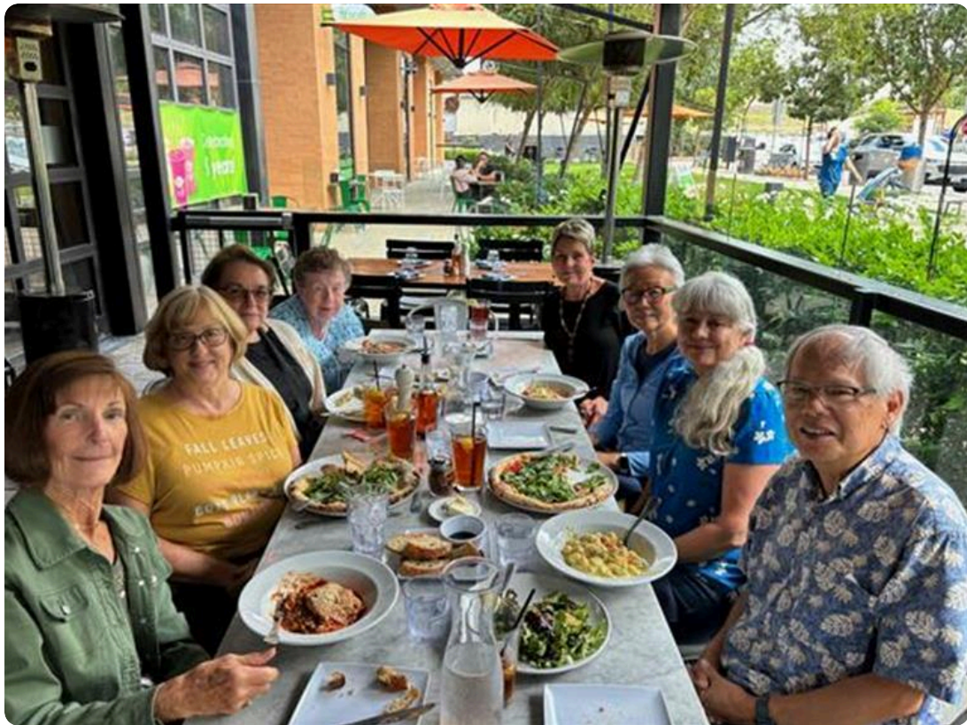
Luncheon at San Marcos with RSB Care Partner Support group