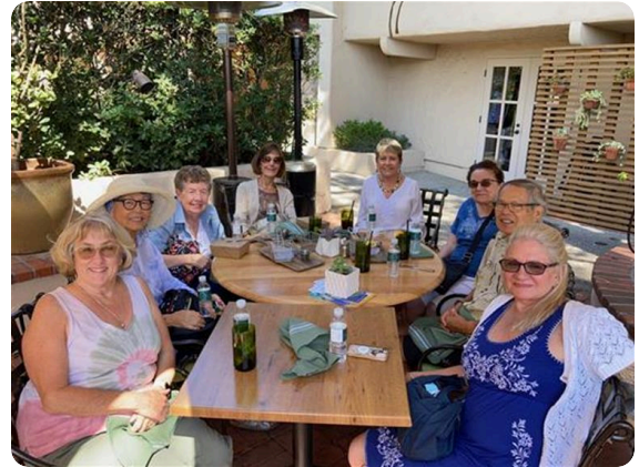
Lunch at RB Inn with RSB Care Partner Support group